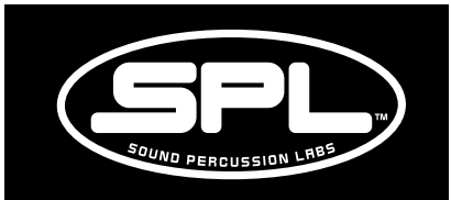
1/c, White, and Reverse Logo Usage